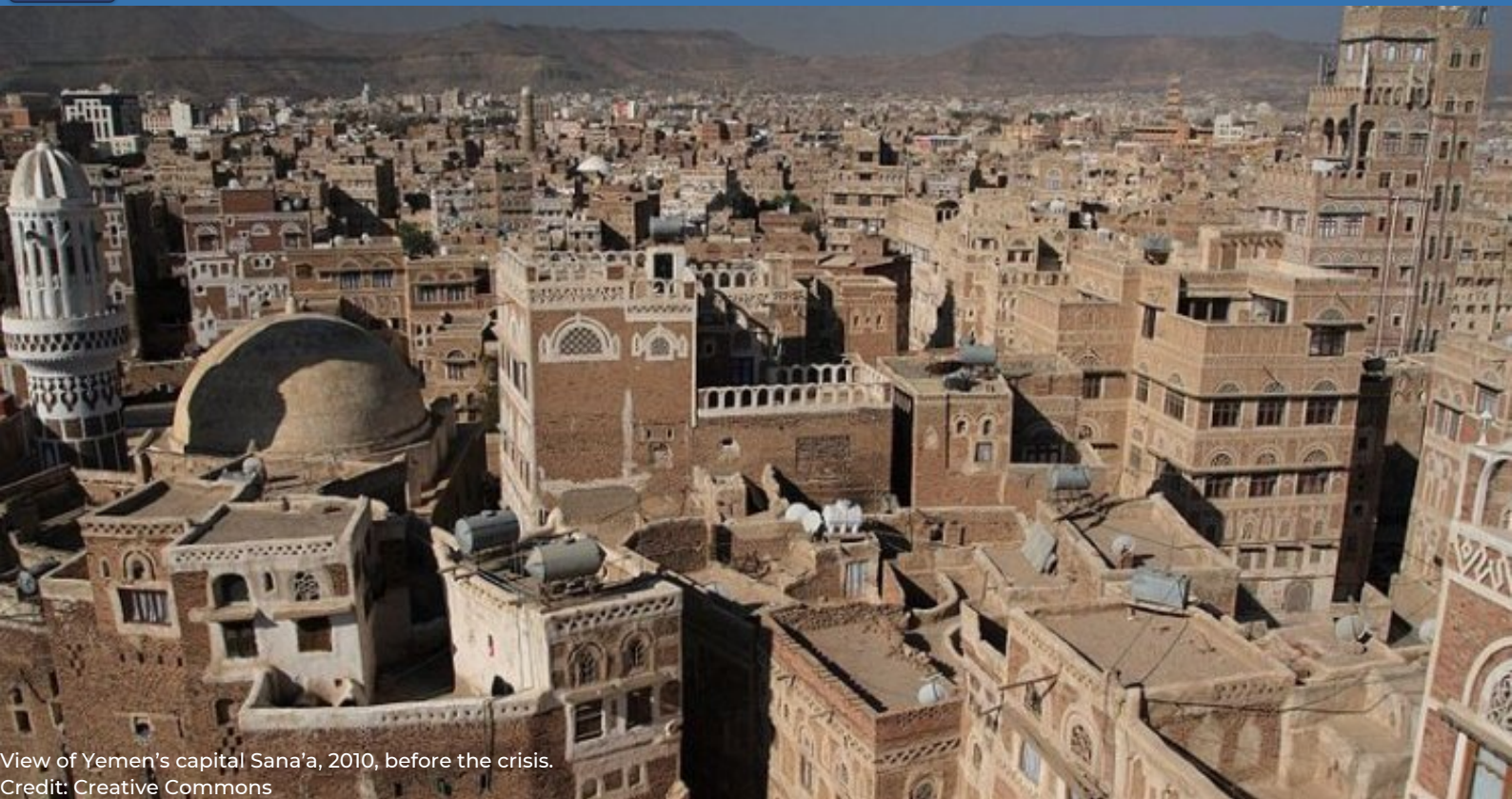
View of Yemen's capital Sana'a, 2010, before the crisis.