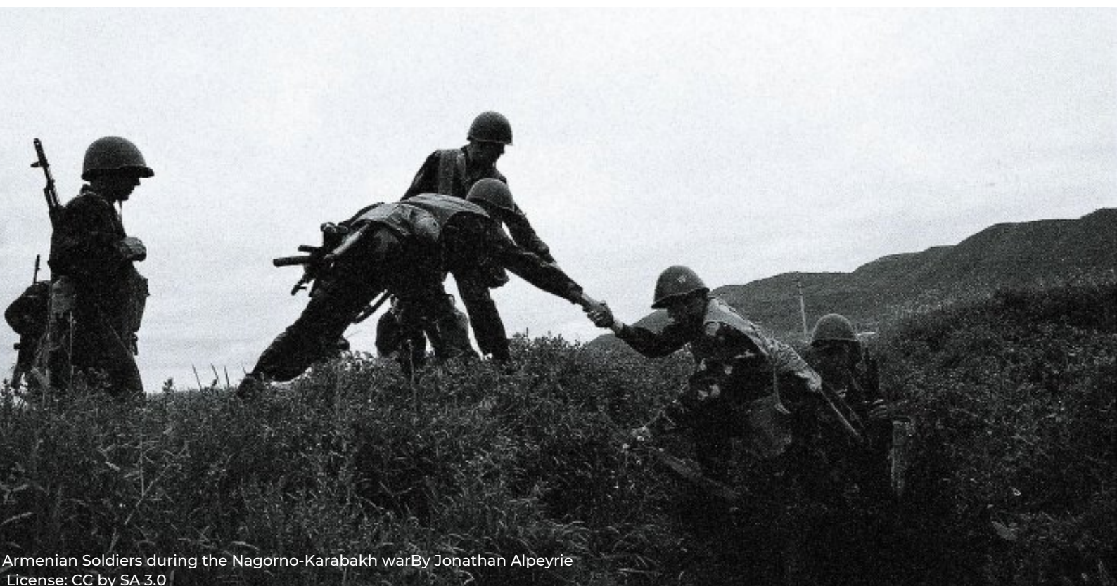
Armenian Soldiers during the Nagorno-Karabakh war

See all our stories at thenewfederalist.eu .