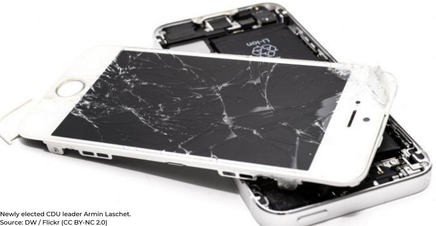
Newly elected CDU leader Armin Laschet.